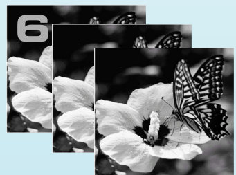
RGB file differential