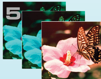
R-G, G-B and R-B analysis