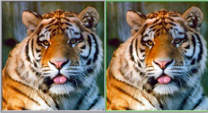
Left: Original image, 3.36 MB