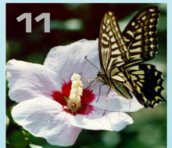
STIF compressed image

10 File conversion, file size reduction, decompression and export