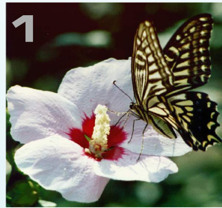
Original bitmap image

ImageCrunch Compression is derived from a proprietary file encoding and image analysis process, as mapped below.